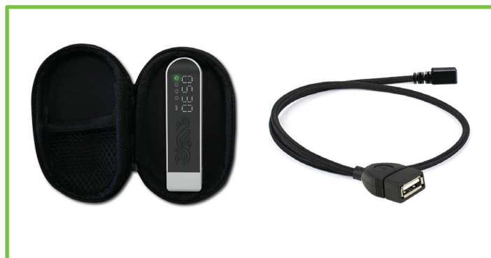
The bundle includes a pocket case, a USB extension cable, and the user manual.