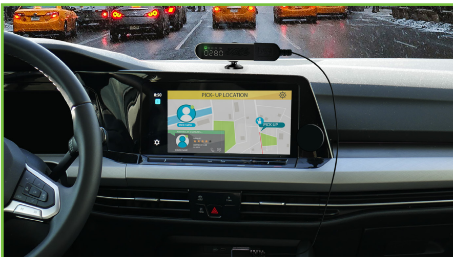
AQD-U for taxis, cars or vehicles