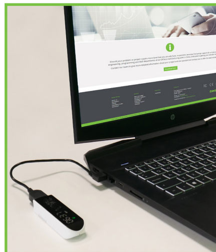
AQD-U for meetings connected to laptops and computers